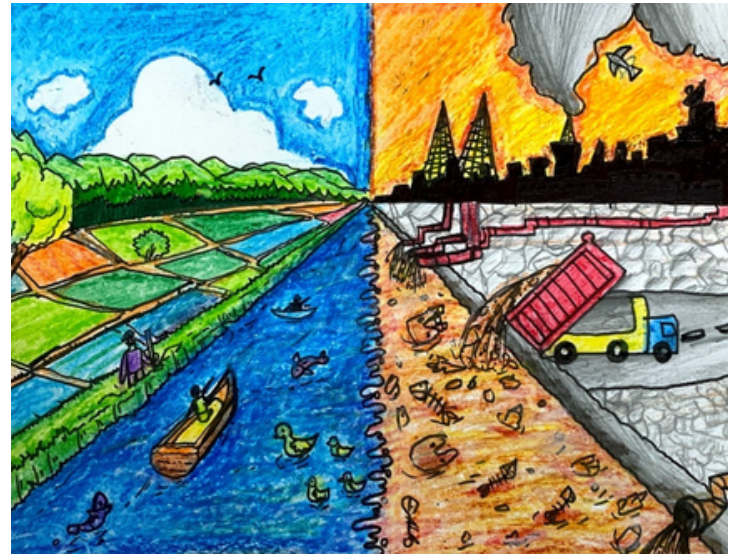
This painting by a 9th grade student contrasting a heavily polluted canal with one in good ecological health was a winner in a competition organized as part of the UNEP-backed project to restore Kochi's TP Canal.

Kerala's port city of Kochi is set to undergo a facelift to revive its once bustling historic canals to fight climate change and flooding. Corporation authorities have roped in UNEP to help revive a canal which runs for about 10 kilometres through the city's central business district and several densely populated residential areas. The initiative is part of UNEP's Generation Restoration Cities initiative and leverages insights from UNEP's Urban NBS spatial Tool for identification and assessment of key environmental data.