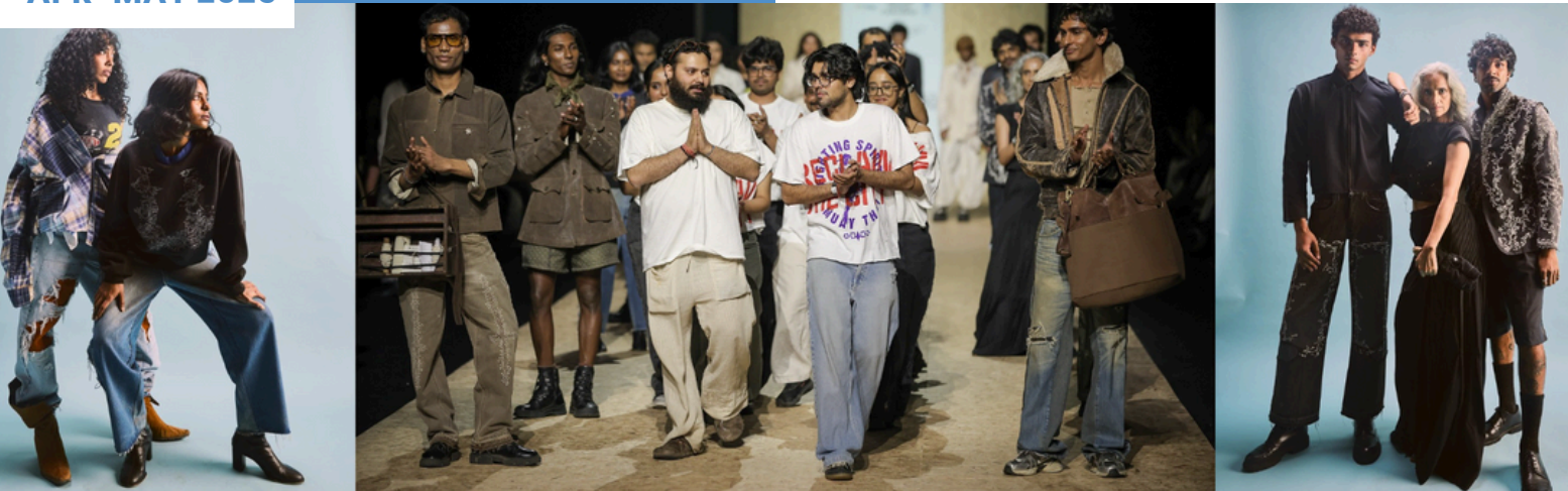
Snippets from the showcase at Lakme Fashion Week in Mumbai from the winner of the R|Elan Circular Design Challenge, India's largest global award for circular fashion supported by United Nations