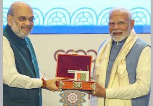
Prime Minister Narendra Modi unveils a stamp at the launch of the 2025 UN Year of Cooperatives