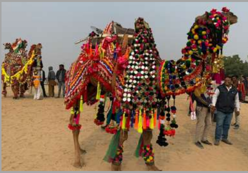
Camel dressing contest at the Year of Camelids celebration led by FAO in Rajasthan