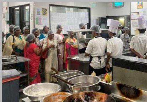
Refugees from Sri Lanka skill up at a hospitality industry workshop hosted by UNHCR