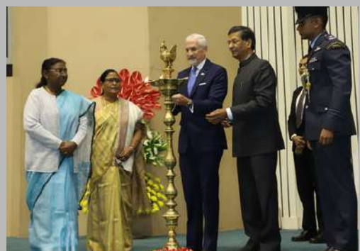
President Droupadi Murmu leads the Human Rights Day commemoration in New Delhi