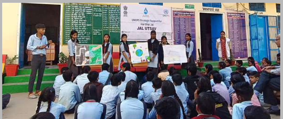
UNOPS leads Jal Utsav awareness sessions for water sustainability in Rajasthan