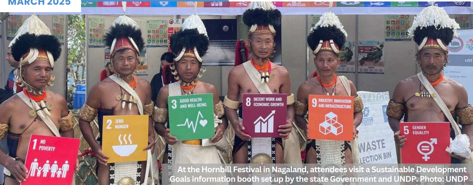
At the Hornbill Festival in Nagaland, attendees visit a Sustainable Development Goals information booth set up by the state Government and UNDP.