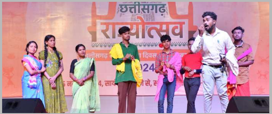
Community leaders host a play at a WFP awareness campaign to boost consumption of fortified rice in Chhattisgarh