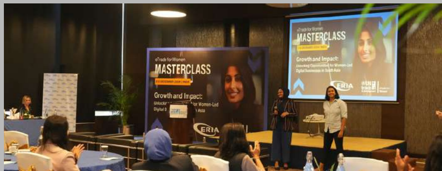
Participants at a trade masterclass hosted by UNCTAD in New Delhi for women entrepreneurs in South Asia