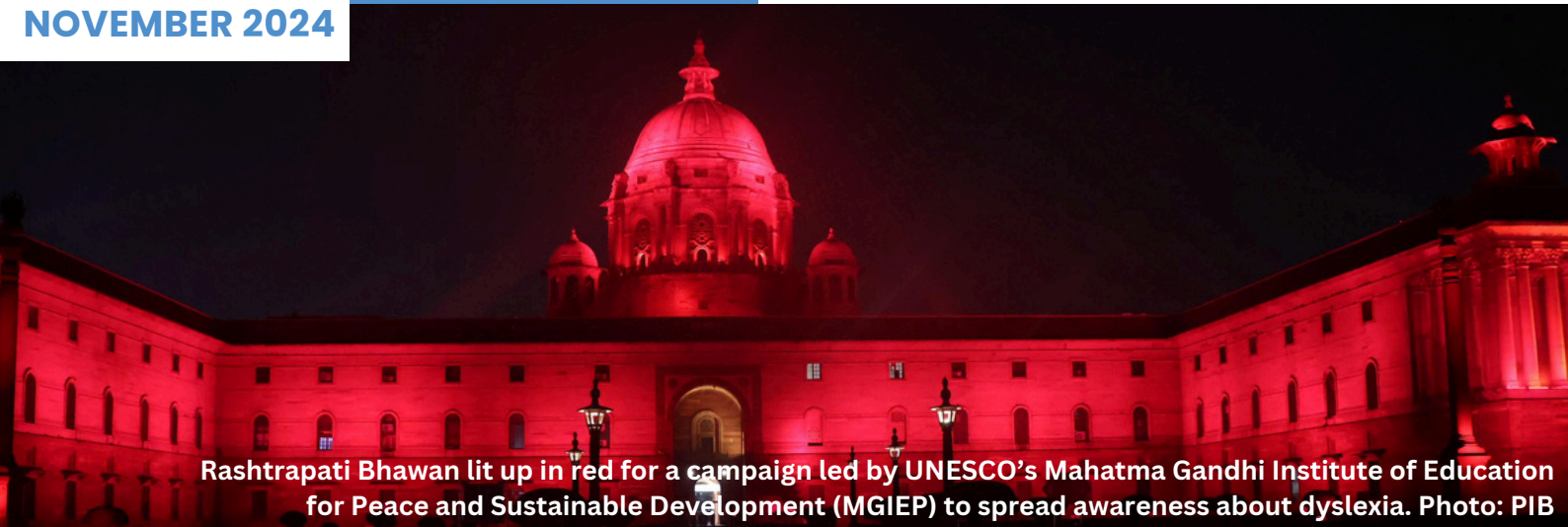
Rashtrapati Bhawan lit up in red for a campaign led by UNESCO's Mahatma Gandhi Institute of Education for Peace and Sustainable Development (MGIEP) to spread awareness about dyslexia.