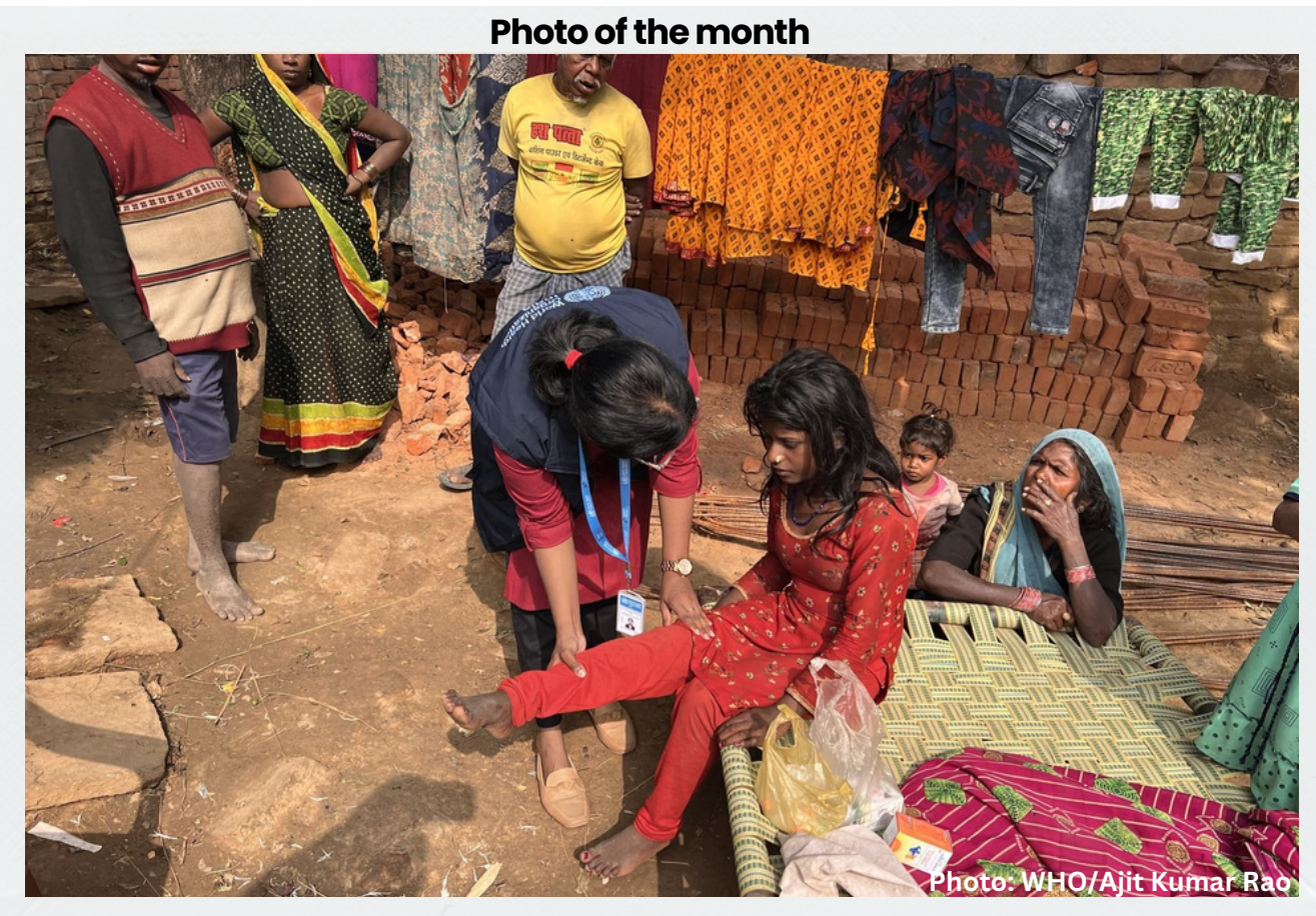
A WHO officer conducts tests to rule out polio in Chandaul district in Uttar Pradesh.